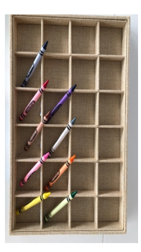
Figure 2: Sample stimuli. 3R/0E condition with animals and 5R/4E condition with crayons. The two functions of the constructions, and animals vs. crayons were separately counterbalanced across